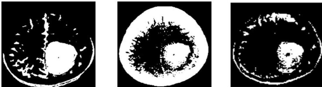
Fig.3: Segmented Images of a) MRI Image b) CT Image c) Fused Output Image