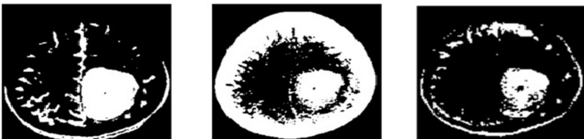
Fig.3: Segmented Images of a) MRI Image b) CT Image c) Fused Output Image